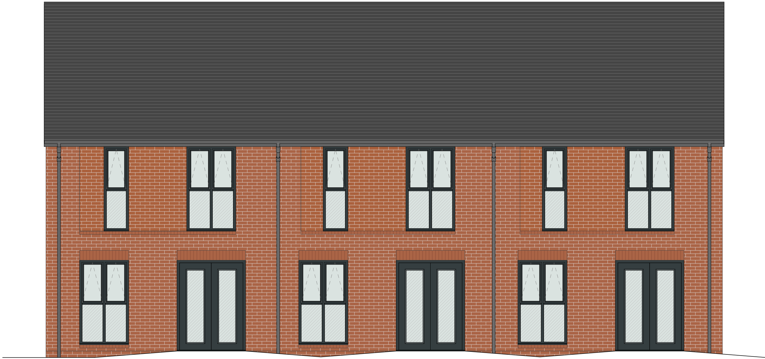
Rear Elevation 1 : 50