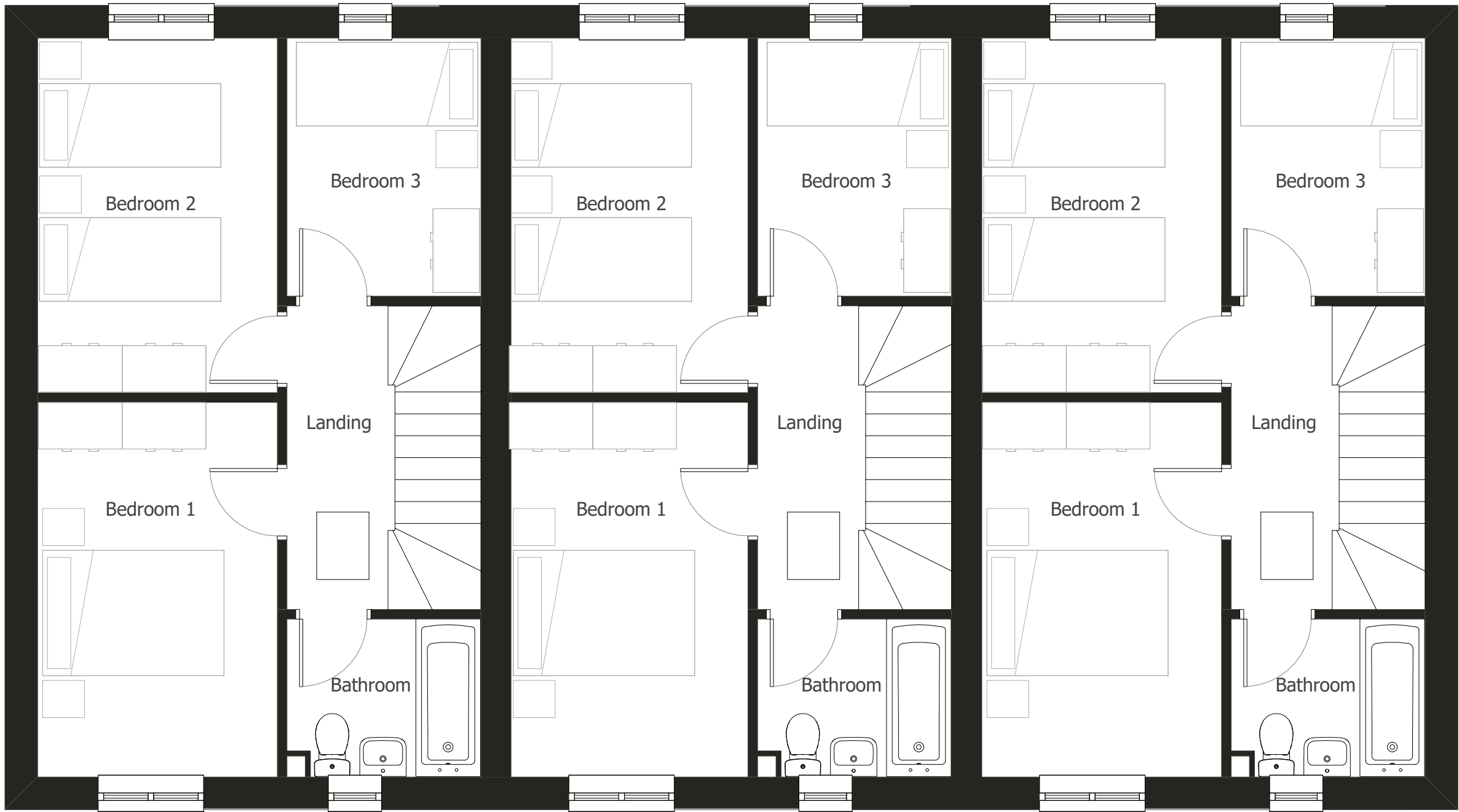
First Floor 1 : 50