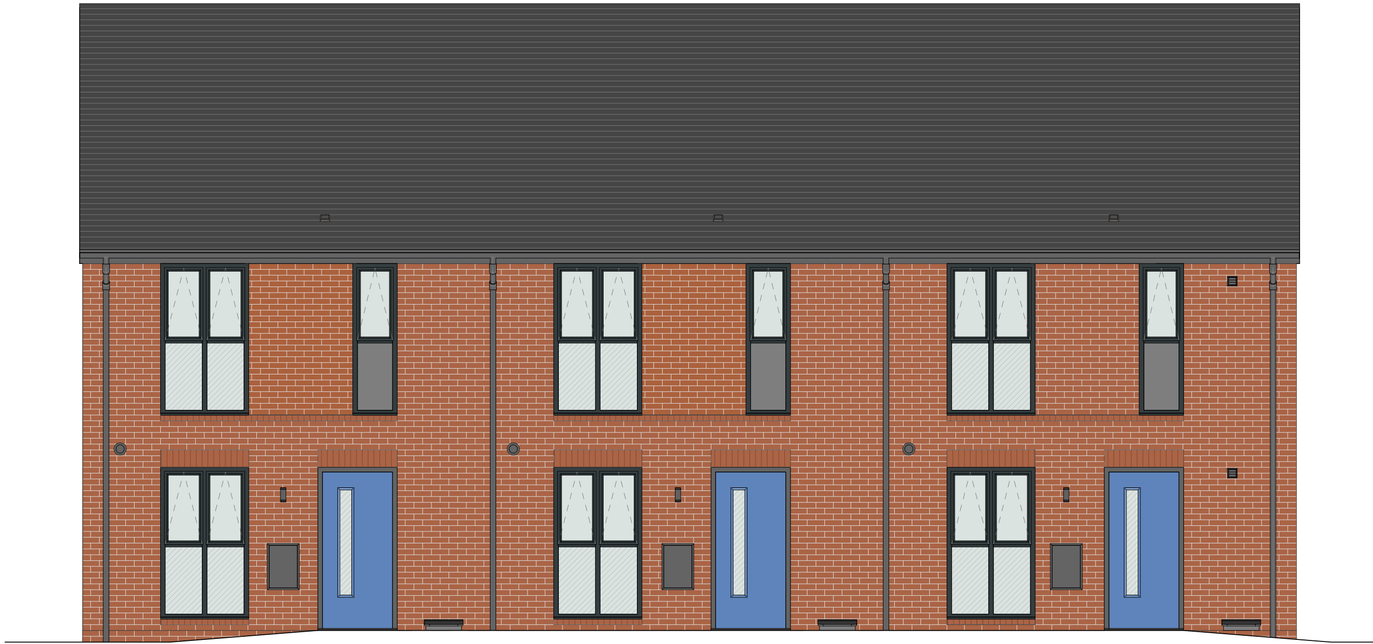
Front Elevation 1 : 50